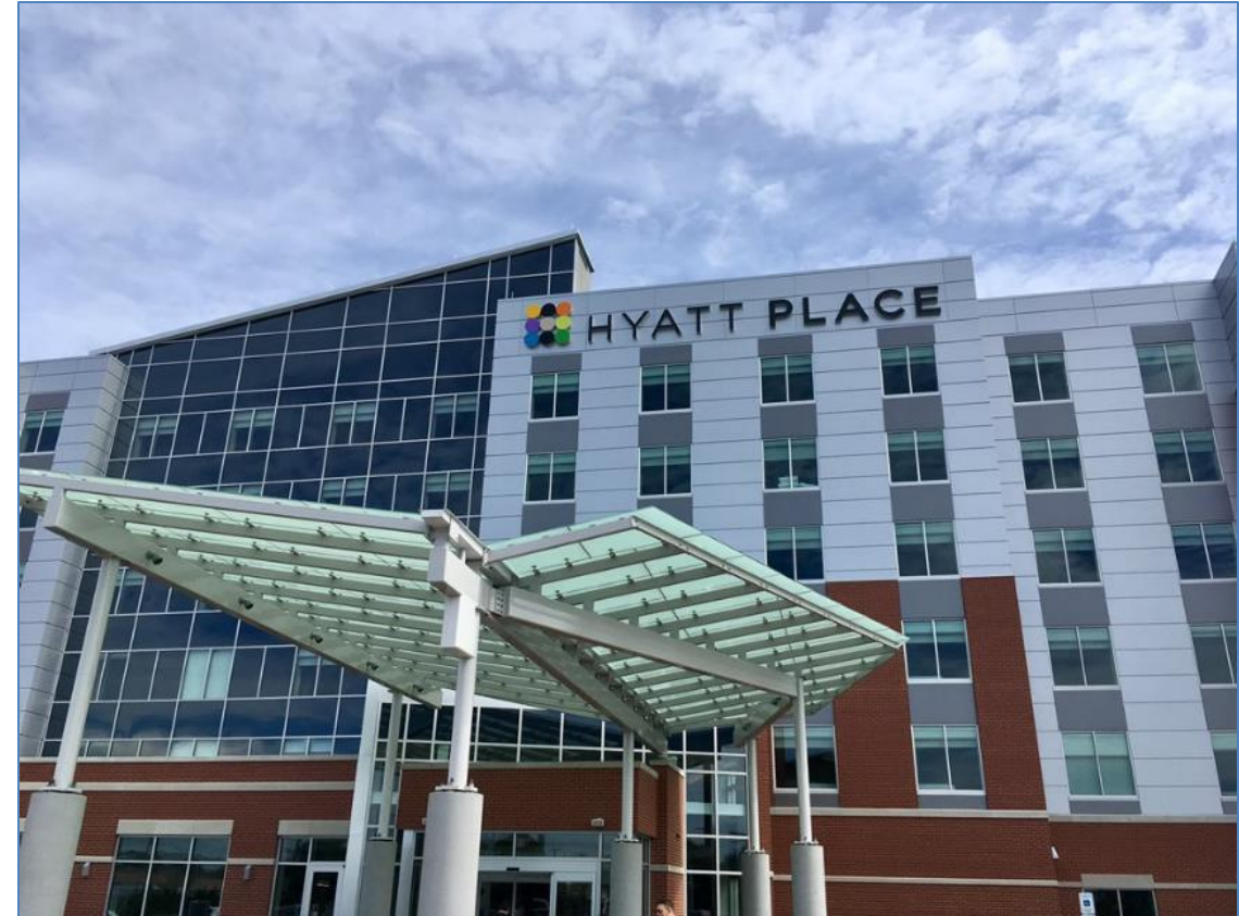
Hyatt Place (Warwick)