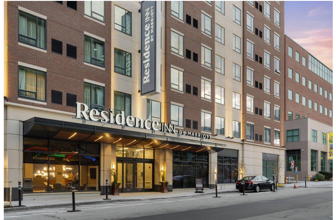
Residence Inn (Providence)