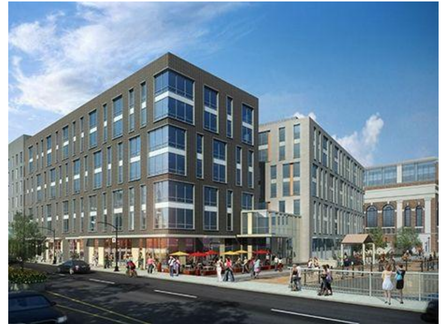
River House (Providence)